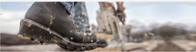
Steel toed boots

Personal protective equipment — or PPE — is equipment worn to minimize exposure to a variety of hazards. The following items of PPE should be properly used at each installation: